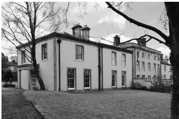
Melling Manor in Lancashire